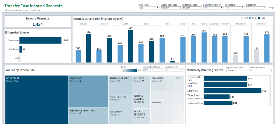
Transfer Center Inbound Dynamic Report - Analyst View