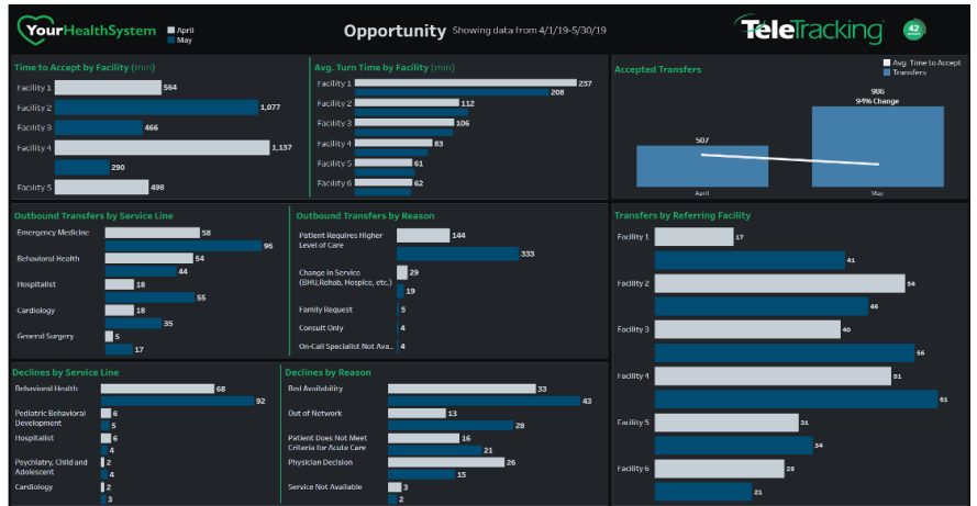
Area of Opportunity Executive Dashboard

As an organization scales, the need for visibility across a system becomes even more crucial. SynapseIQ Enterprise Analytics helps teams understand the full picture, identify workflow silos that may be impacting other departments and quickly determine if issues are systemic or site-specific. Enterprise transparency, with dashboard data that refreshes automatically, allows operational leaders to standardize processes, benchmark against departments, and manage global performance initiatives over time.