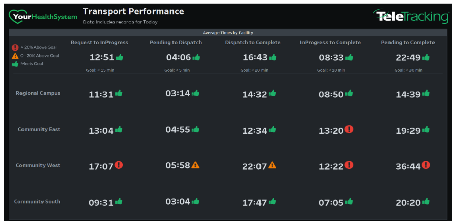
Enterprise Transport Performance Dashboard - Command Center View